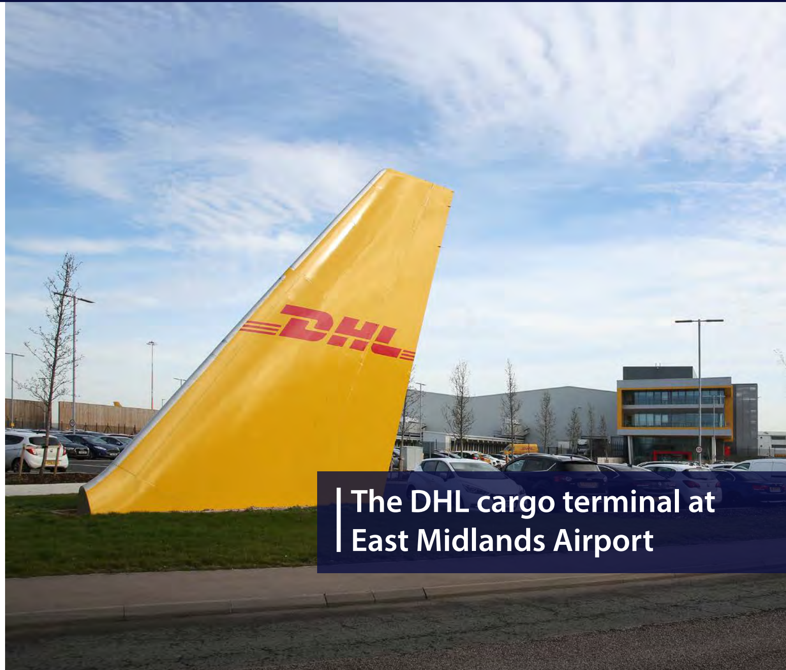
The DHL cargo terminal at East Midlands Airport